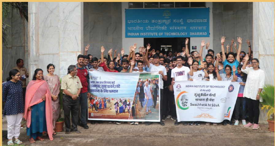
Swachhata hi Seva