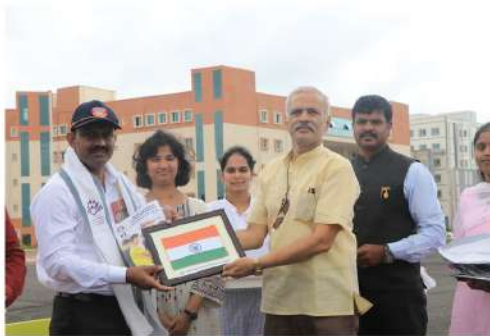
VEErON kA Vandan

The National Service Scheme (NSS) Unit of IIT dhArwAD conducted the 1. Panch PrAn Pledge 2. VEErON kA Vandan 3. VasudhA Vandan on 15th August 2023.