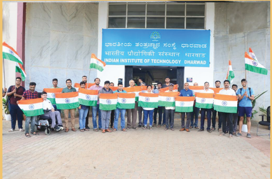
Har Ghar Tiranga