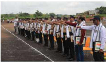
Panch PrAn Pledge

The National Service Scheme (NSS) Unit of IIT dhArwAD conducted the 1. Panch PrAn Pledge 2. VEErON kA Vandan 3. VasudhA Vandan on 15th August 2023.